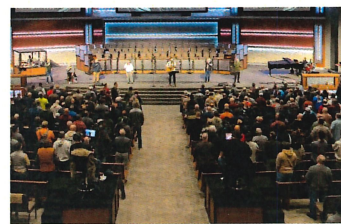
Crossway Baptist Men's Meeting